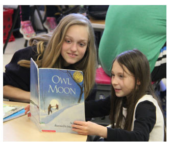
Sixth grade students visited Port Dickinson Elementary to share books they wrote and published in their ELA Lab Classes, and some of their other favorite tales.

PD teachers said this was the second year of the event. The goal is to encourage the younger students to keep working on their reading and writing skills.