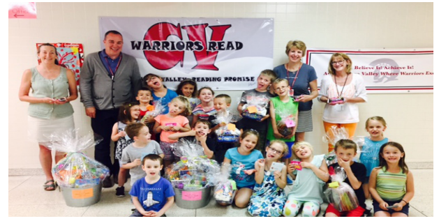
Pictured above are some of the winners from Port Dickinson's Reading Promise, "Attack the Stack" contest!

Winners were chosen at random. Students were entered into the drawing by completing a "stack" of different books at their grade level.